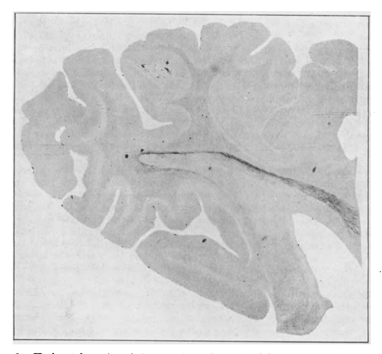
FIG. 1.—Horizontal section of the occipital lobe, stained by Weigert-Pal method and showing the general absence of myelinated fibres except in the optic radiations which stain fairly dark.

On examination in the National Hospital she was seen to be a fairly well nourished child of the normal size for her age. She lay in bed with the head retracted, the arms extended, the back bent forwards and the legs crossed. She whined continually. She was quite incoöperative and inattentive but she opened her eyes widely if her name was spoken in either ear. She seemed to be quite blind. The skull measured 49.5 cm. in its greatest circumference. The pupils reacted to light but constantly varied in size. The optic discs and